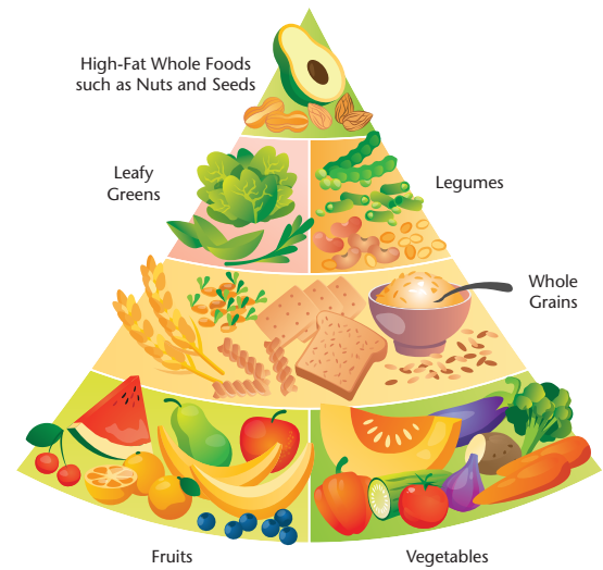
The Healthy Vegan Food Pyramid